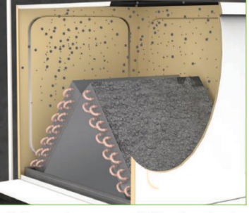
Mold commonly grows on wet HVAC cooling coils and surrounding areas producing mold allergen (spores) and insulating the coil, wasting energy.