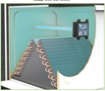
The Eco-Sun 2000's germicidal UV light prevents nold, bacteria and virus infestation and the clean coil will operate at optimum efficency, saving energy.